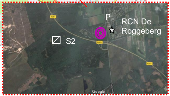
Location Stage 2