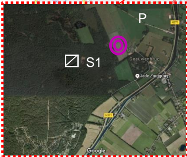
Location Stage 1